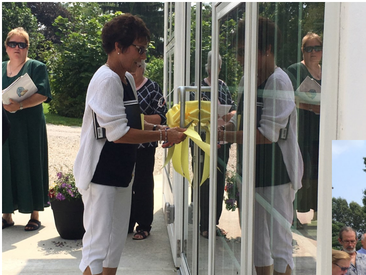
Ribbon Cutting Ceremony