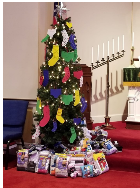
Christmas in July New undies and socks collection