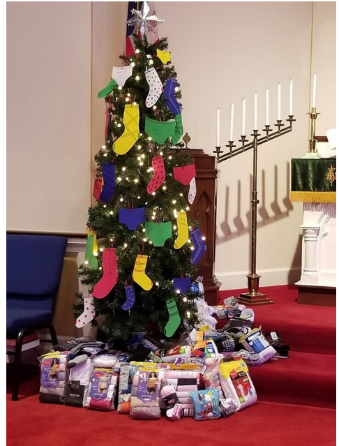
Christmas in July New undies and socks collection

Sharon Center United Methodist celebrated "Christmas in July" on July 28 complete with a Christmas tree and caroling! As a part of our worship on that special day we collected over 1500 new socks, underpants, and undershirts for men, women and children. Brand new in-package underwear was delivered to Feed My Sheep Ministries in Alliance and Rahab Ministries in Akron. Feed My Sheep reaches out to low income families and homeless in the name of Jesus Christ. Rahab Ministries reaches out to women who have been trafficked and abused. Our prayer is that this gift will benefit homeless, low income, abused and trafficked persons both locally and in Northeast Ohio. To God be the glory!