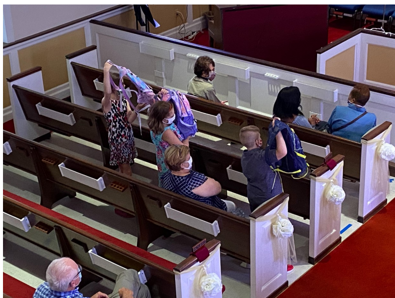
Blessing of Backpack Sunday