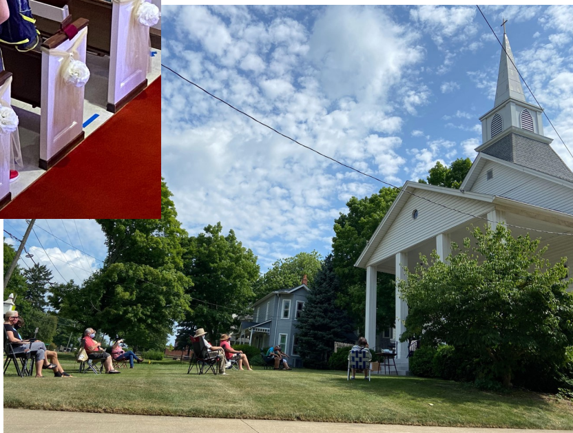
Service on the lawn