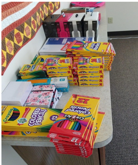
New undie collection and school supply collection