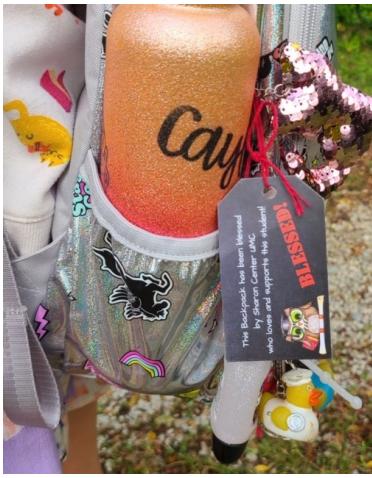
Backpack tags Picnic table making for Highland Schools