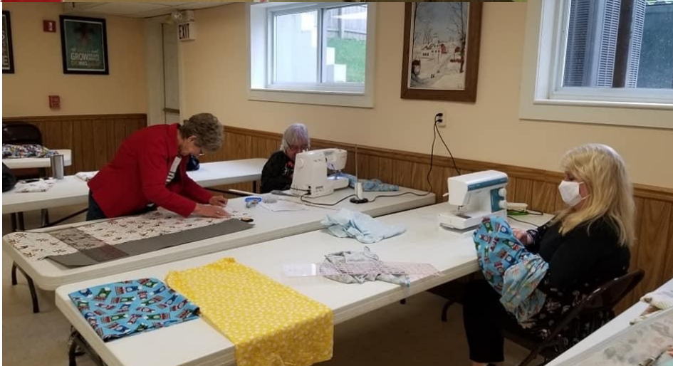
Making baby bed sheets