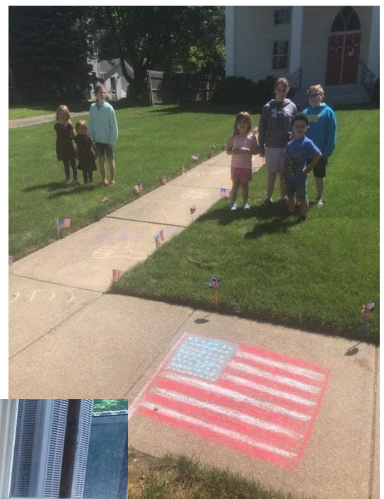
Sidewalk chalk drawing for Pancake Breakfast